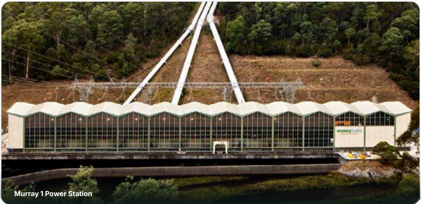
Murray 1 Power Station