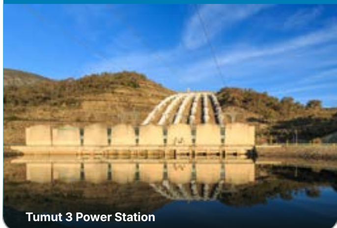
Tumut 3 Power Station

Nine in operation and one spare single-phase oil-filled, water-cooled transformers