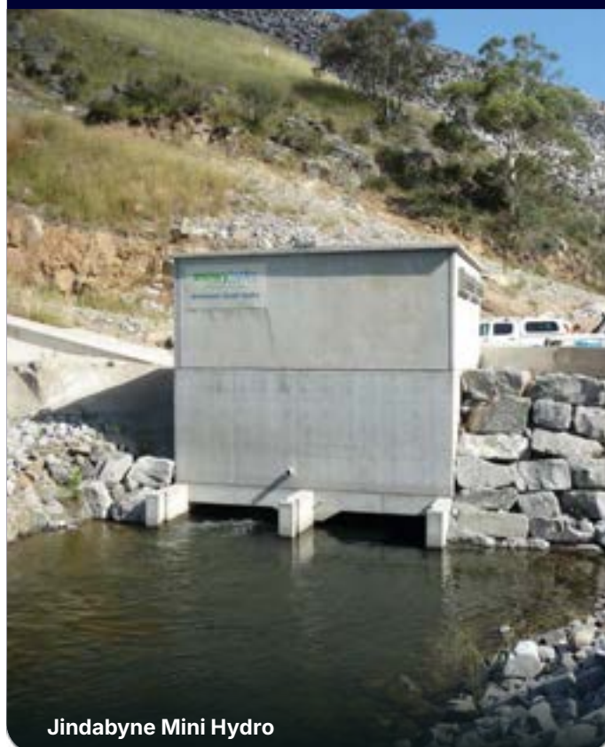
Jindabyne Mini Hydro