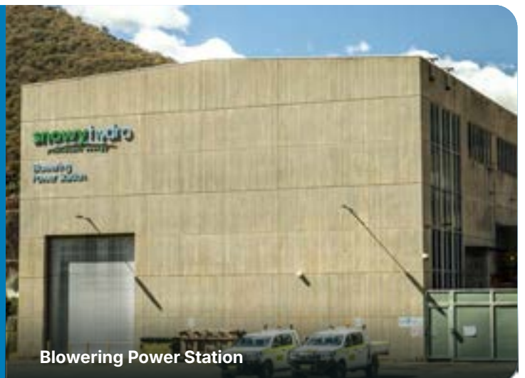
Blowering Power Station