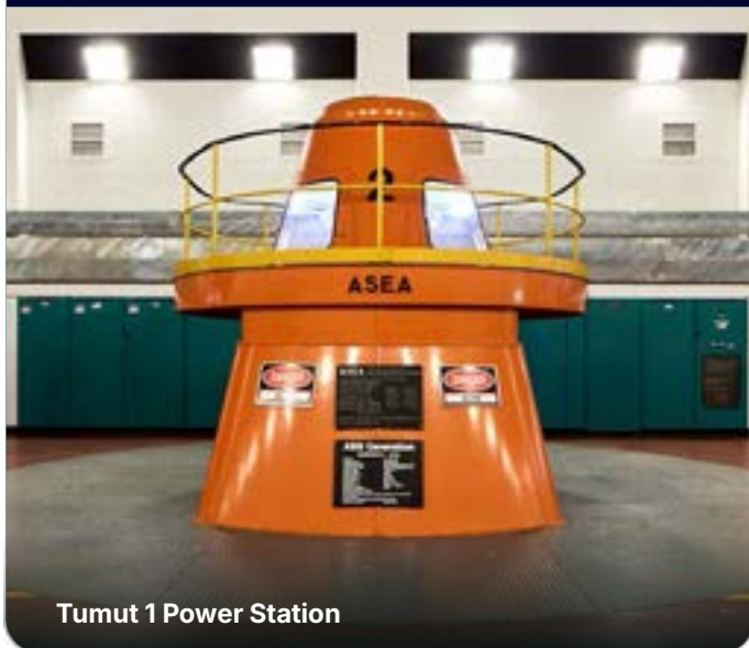
Tumut 1 Power Station