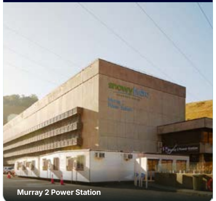
Murray 2 Power Station