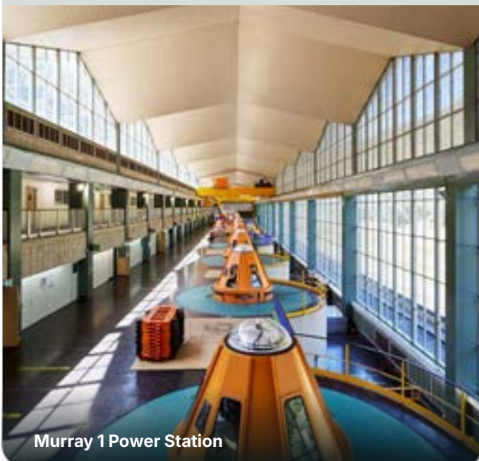
Murray 1 Power Station