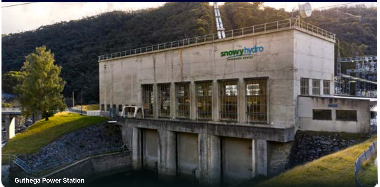
Guthega Power Station